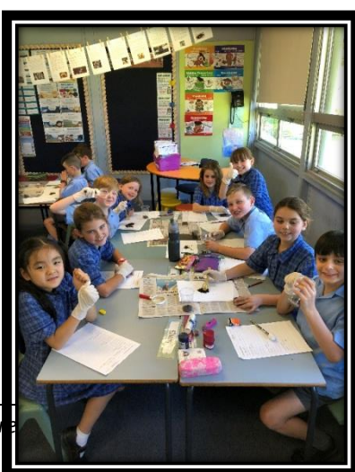
ol we ai