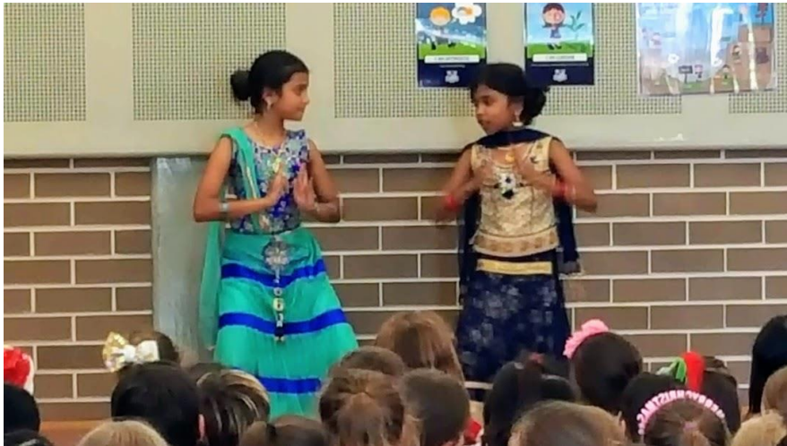
Students performing at the Talent Show

As you can see we have had a wonderful year with lots of success. Thank you to all the SRC members who came to meetings, shared ideas and helped to create a memorable 2018.