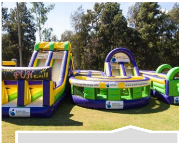
Extreme Fun Run