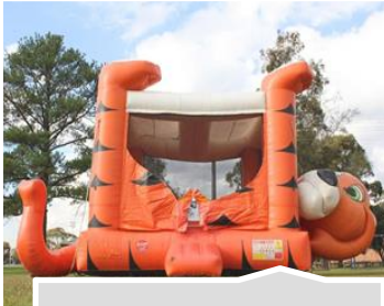
Tiger Belly Bouncer

On the Day – Ride Bands will cost $30 p/band or rides will cost $5 p/ride on the day