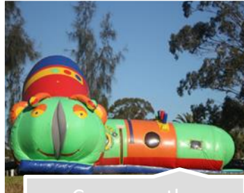
Cameron the Kaddepillar