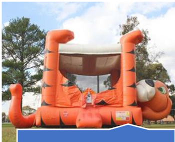
Tiger Belly Bouncer

On the Day – Ride Bands will cost $30 p/band or rides will cost $5 p/ride on the day