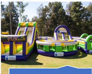
Extreme Fun Run