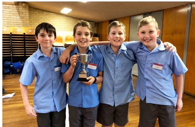
Congratulations on the J.K.O.T team who won the paper plane competition and a trophy for our school.