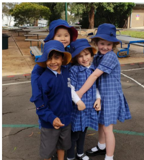
Back at school with our friends!