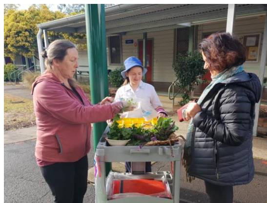
Lots of delicious school grown vegetables for sale each Tuesday!