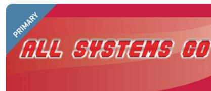
Stage 2: All Systems Go