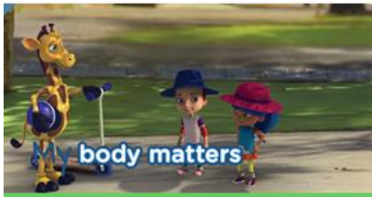
Kindergarten: My Body Matters