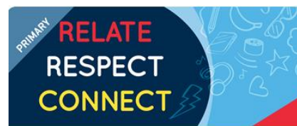
Stage 3: Relate, Respect, Connect

Additional information about the programs can be found at: